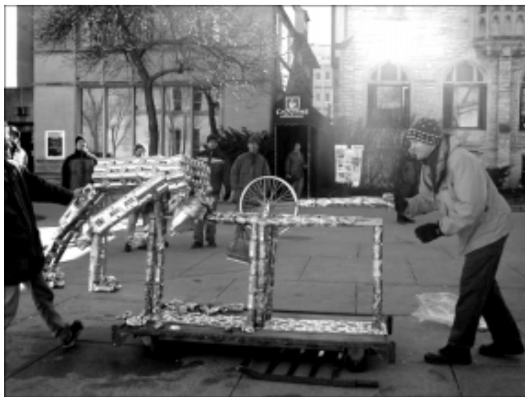
Ironically, The Tin Man met an ignominious end when it was “cannibalized” by another contest entry — a can crusher also made from aluminum cans — filled with 150 lbs. of cement!