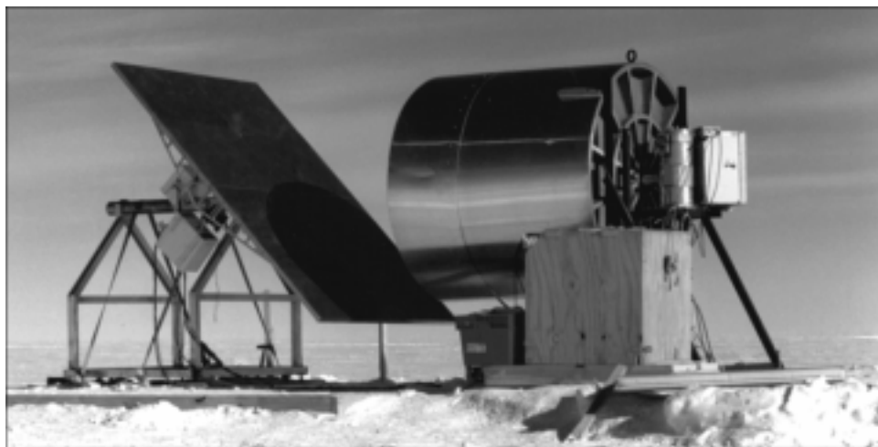
"Big Plate" at Dome C. A 1.5 m diameter reflector telescope points at a large steerable mirror, which sweeps the beam across the sky to make a map of the 2.7 K cosmic microwave background radiation. At the far right, behind the telescope, is a cryostat that cools the detectors to 300 mK.