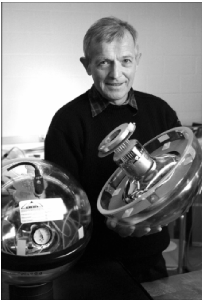
Francis Halzen, a UW-Madison professor who helped develop AMANDA, shows the inside of one of the 422 basketball-sized glass orbs, called photomultiplier tubes, used to catch the fleeting signals left by high-energy neutrinos.

telescopes on remote mountaintops, satellites and radio telescopes. But photons can be deflected and absorbed as they traverse space and encounter interstellar dust and pockets of gas and radiation. The cosmic neutrino, on the other hand, is unhindered by such obstacles. The tradeoff, says Morse, is that neutrinos are very hard to detect. Moreover, the sun and cosmic rays crashing into the Earth's atmosphere also make neutrinos, creating a soup of high-energy particles.