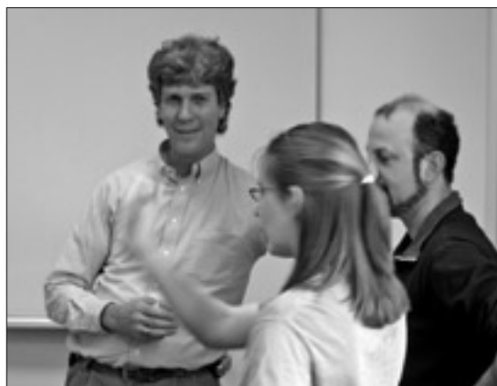
Physics-biochemistry-chemistry coordinators planning