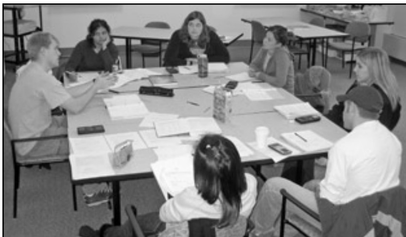
Small study groups led by peer tutors

■ ■ ■ “There is much more personal attention in the small groups, and I am not afraid people will judge the questions that I am asking because it is a comfortable atmosphere.” ■ ■ ■