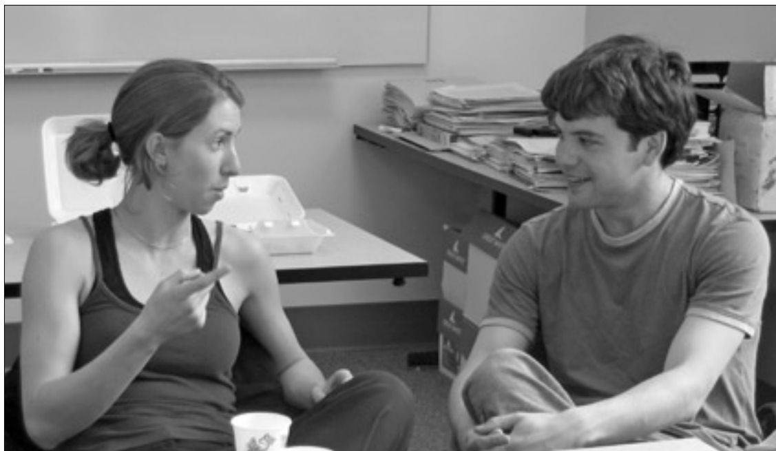
Peer Mentor Tutors

Striving to Promote the Success of all Students