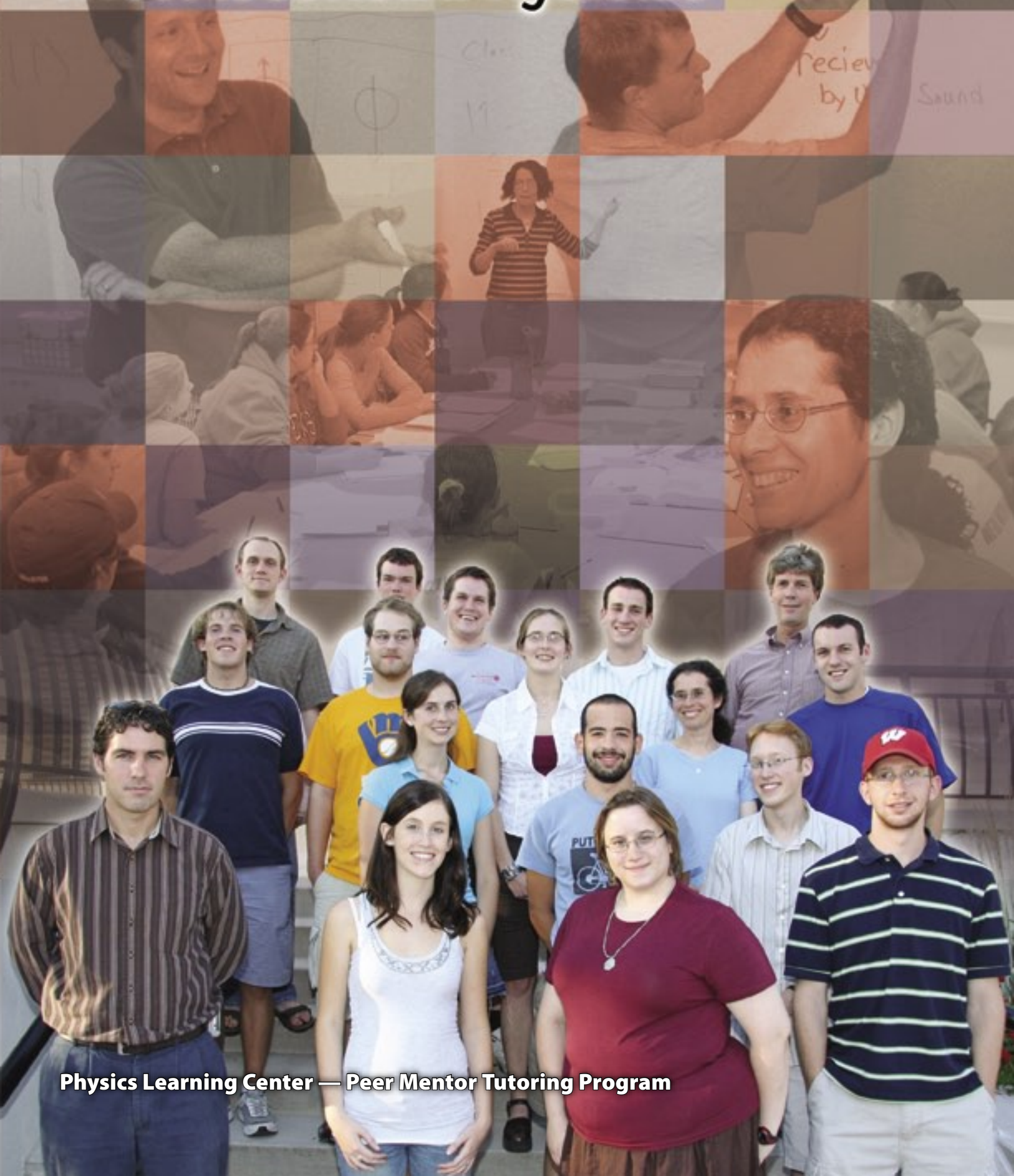
Physics Learning Center — Peer Mentor Tutoring Program

Newsletter for University of Wisconsin Physics Alumni Vol. 13 No. 1 Fall/Winter 2006