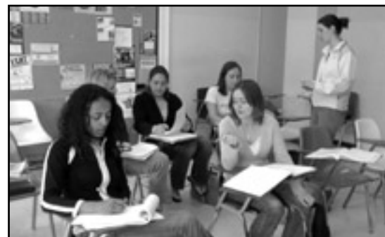
Another small study group

■ ■ ■ “My grades last semester were a C,C and F. This semester ... C, AB, B. Need I say more?” ■ ■ ■