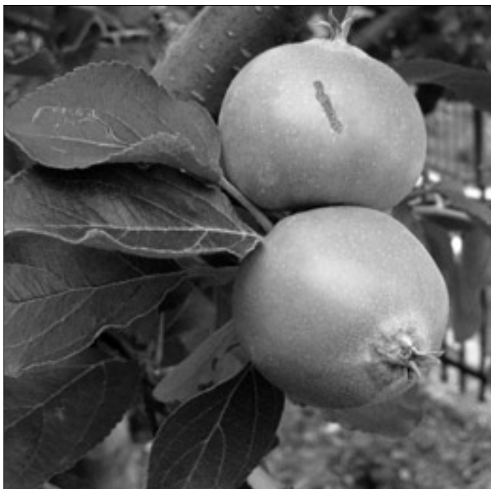
Apples from Newton's apple tree